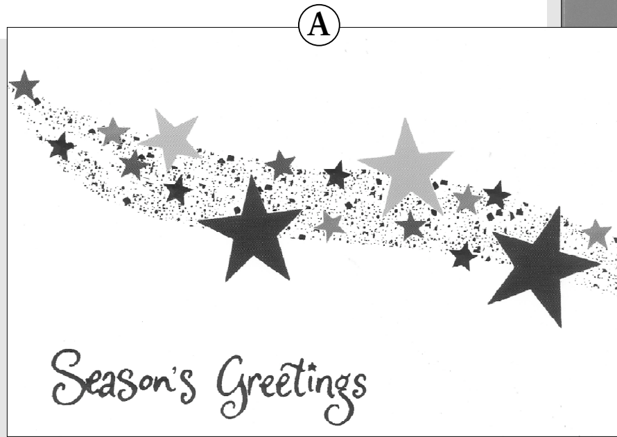
Christmas Card samples shown here are smaller than actual size